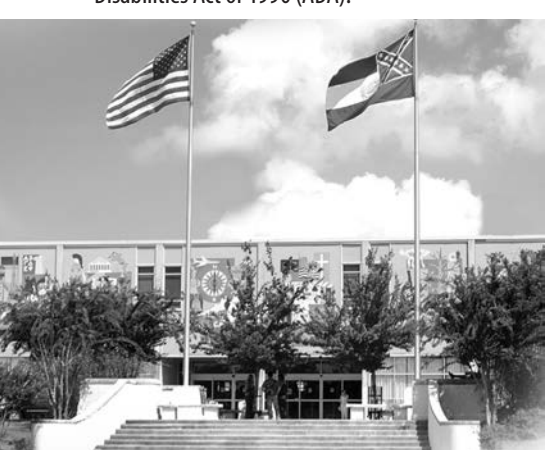
General Admission Requirements MCC ascribes to an "open admissions" policy

Meridian Community College is committed to providing excellent post-secondary educational opportunities. MCC does not exclude from participation in, deny the benefits of, or otherwise discriminate against any person in any program or activity of the College on the basis of race, religion, color, national origin, sex, age, or disability. This is in compliance with Title VI of the Civil Rights Act of 1964; Title IX, Education Amendments of 1972 of the Higher Education Act; the Age Discrimination Act of 1975; Section 504 of the Rehabilitation Act of 1973, as amended; and the Americans with Disabilities Act of 1990 (ADA).