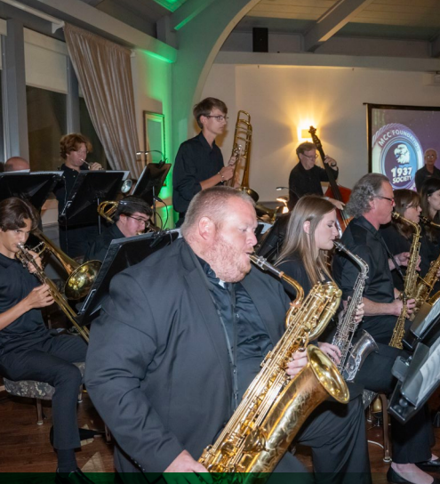
Members of the MCC Jazz Band