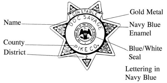
Figure 2 Badge